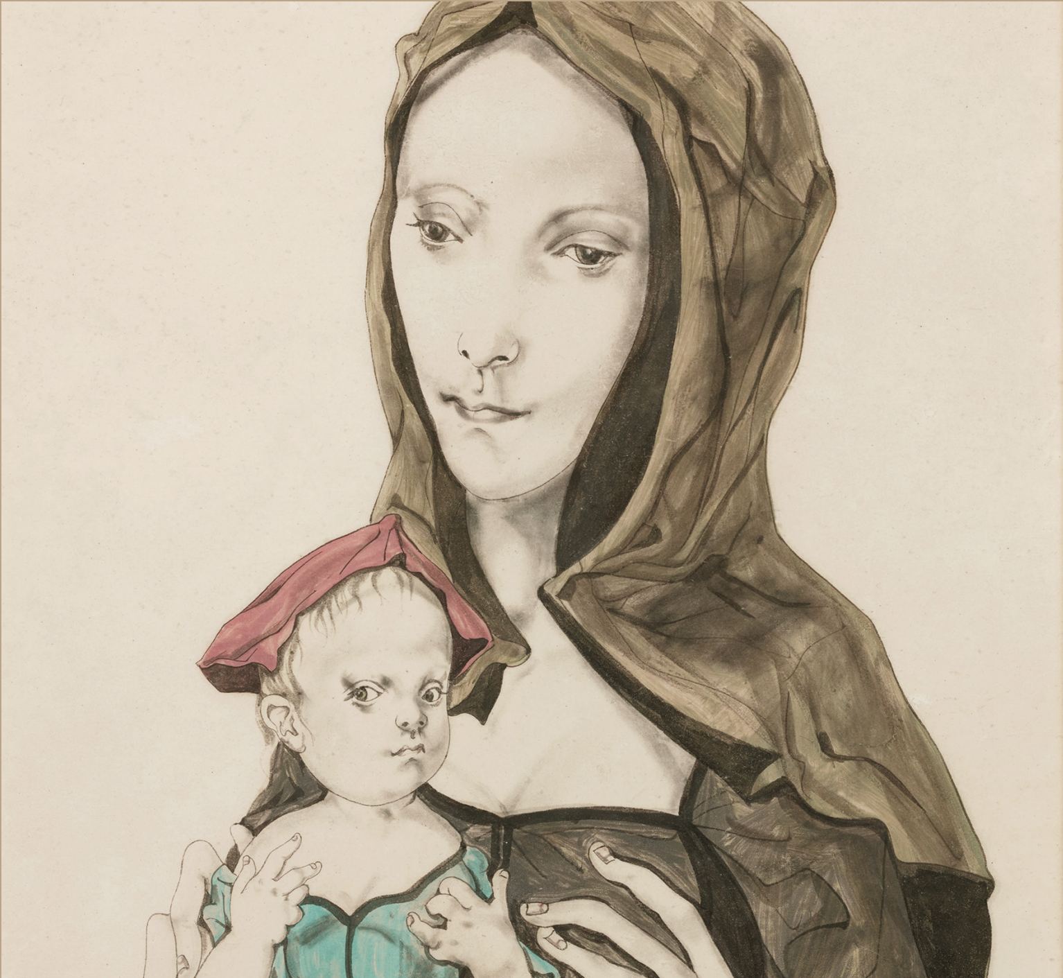
Portrait of a Mother and Child