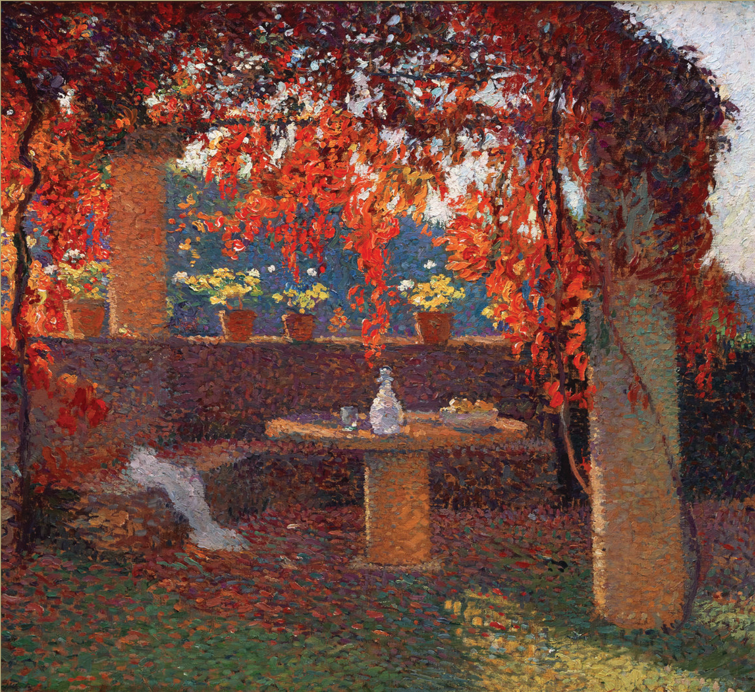
Tonnelle nord-ouest au Parc de Marquayrol (La Pergola)