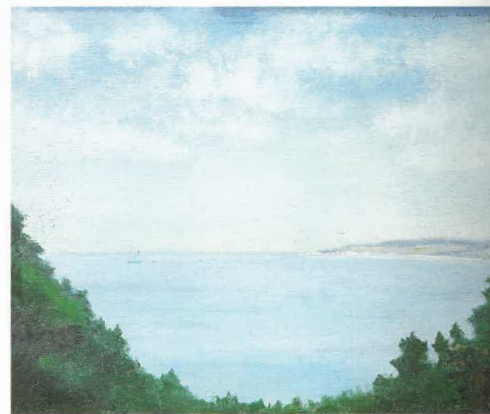
Fig 512 (C 525) right This is a view at Branksome Dean, the home near Bournemouth on England's south coast of the financier Sir Ernest Cassel. Uniquely it is signed and inscribed: 'Mrs Cassels from Winston 1916'.