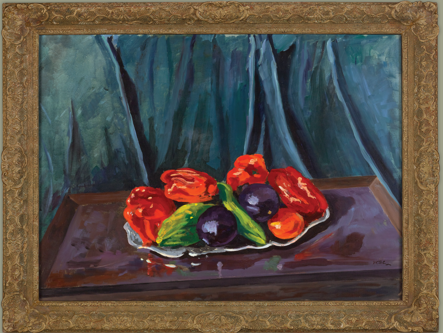
Still Life of Aubergines and Red Peppers on a Silver Tray