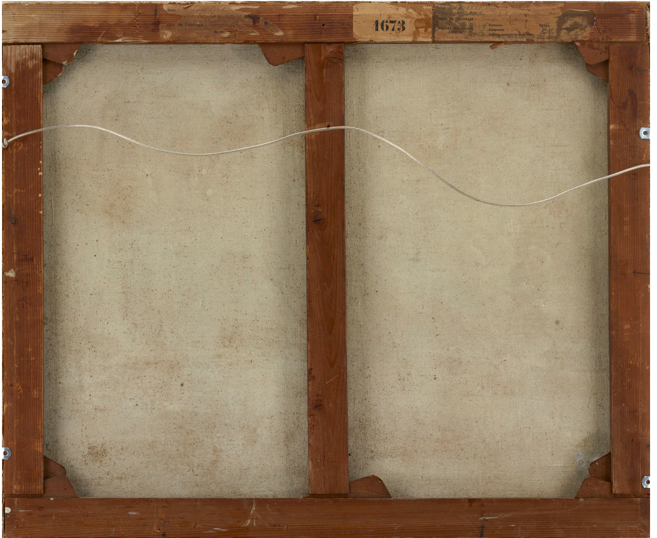
Exhibited at the Salons des Indépendants 1933, original exhibition label en verso