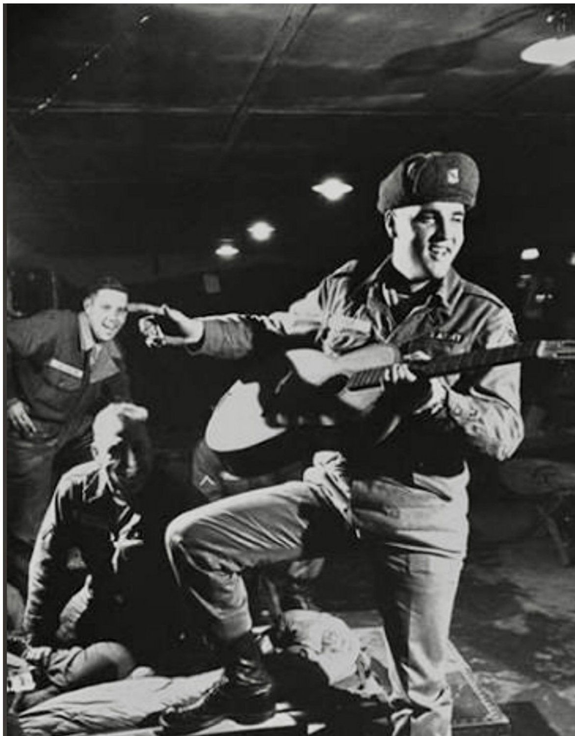
Elvis photographed with what is very likely this guitar on November 28, 1958, at the U.S. Army Training Area in Grafenwoehr, Germany.